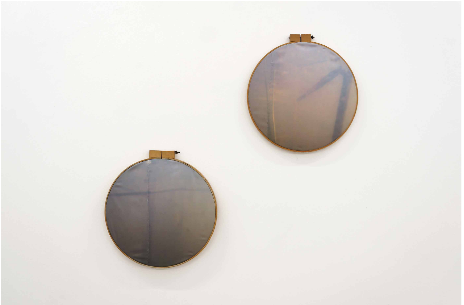
Broken and Contrite and Ask, Seek, Knock 2017 pigment print on fabric with vintage embroidery hoop 19.5" h x 18.5" w each