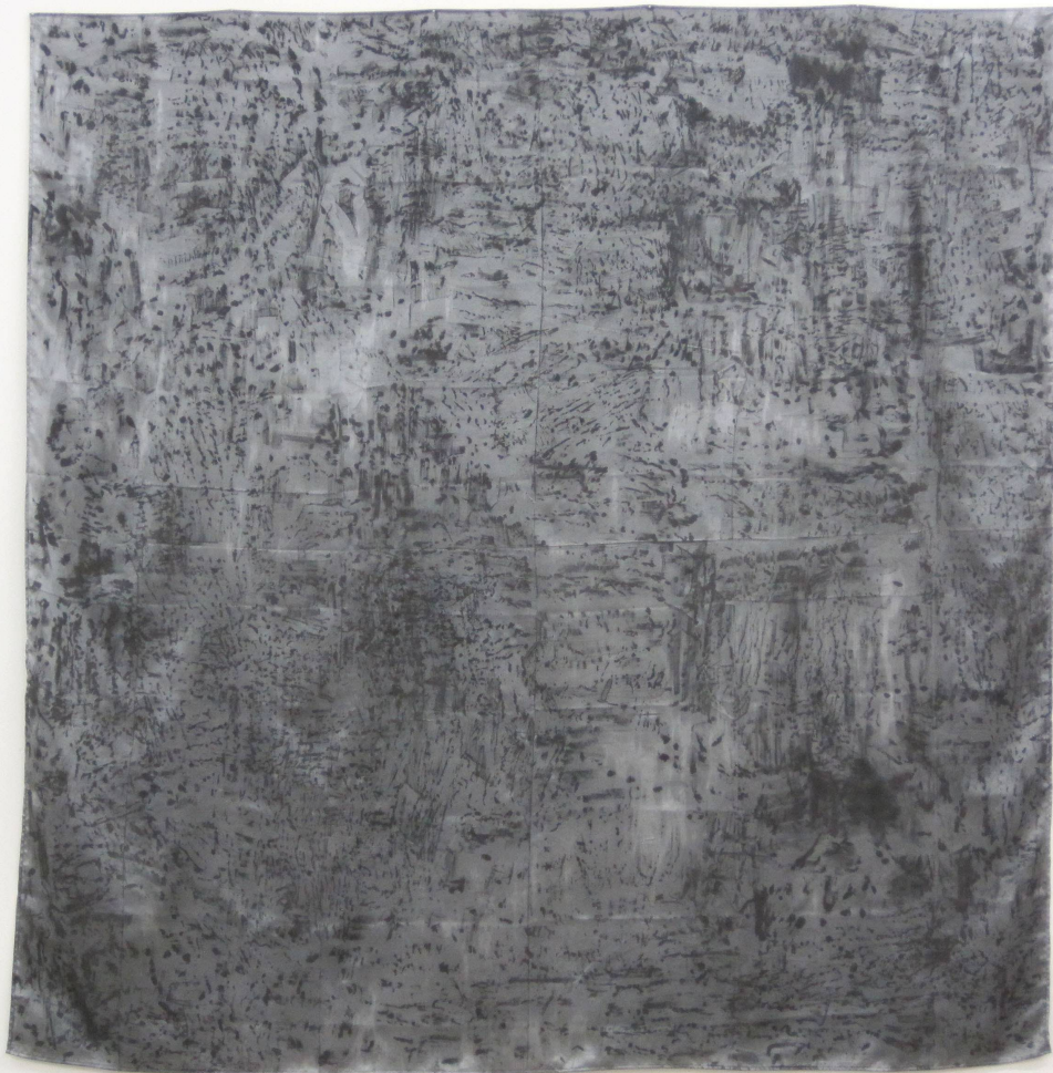
Forged II oil on polyester, 72 inches x 72 inches, 2015