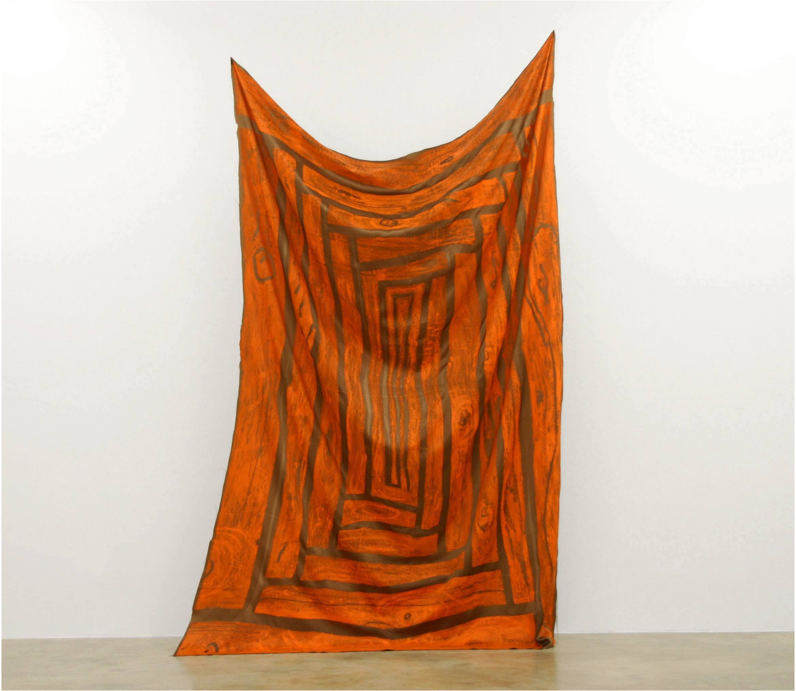
Warped oil on polyester, 72 inches x 130 inches, 2015