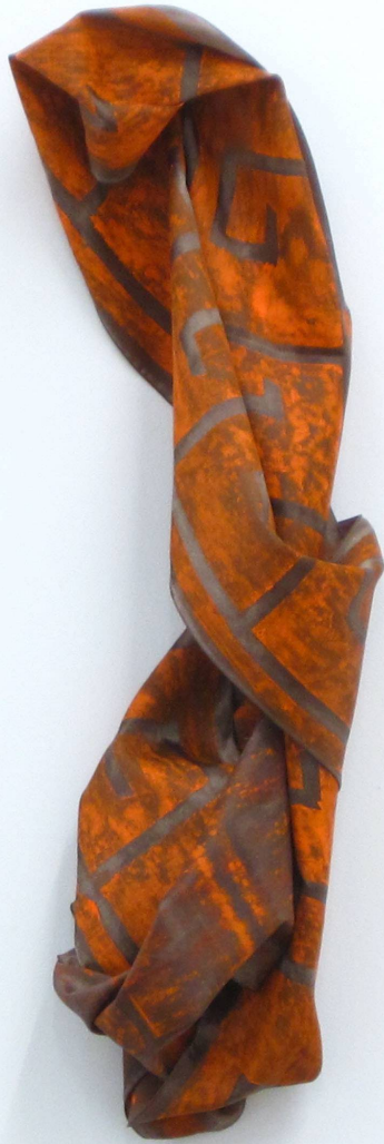
Rusted I, Twisted oil on Polyester, dimensions variable, 2015