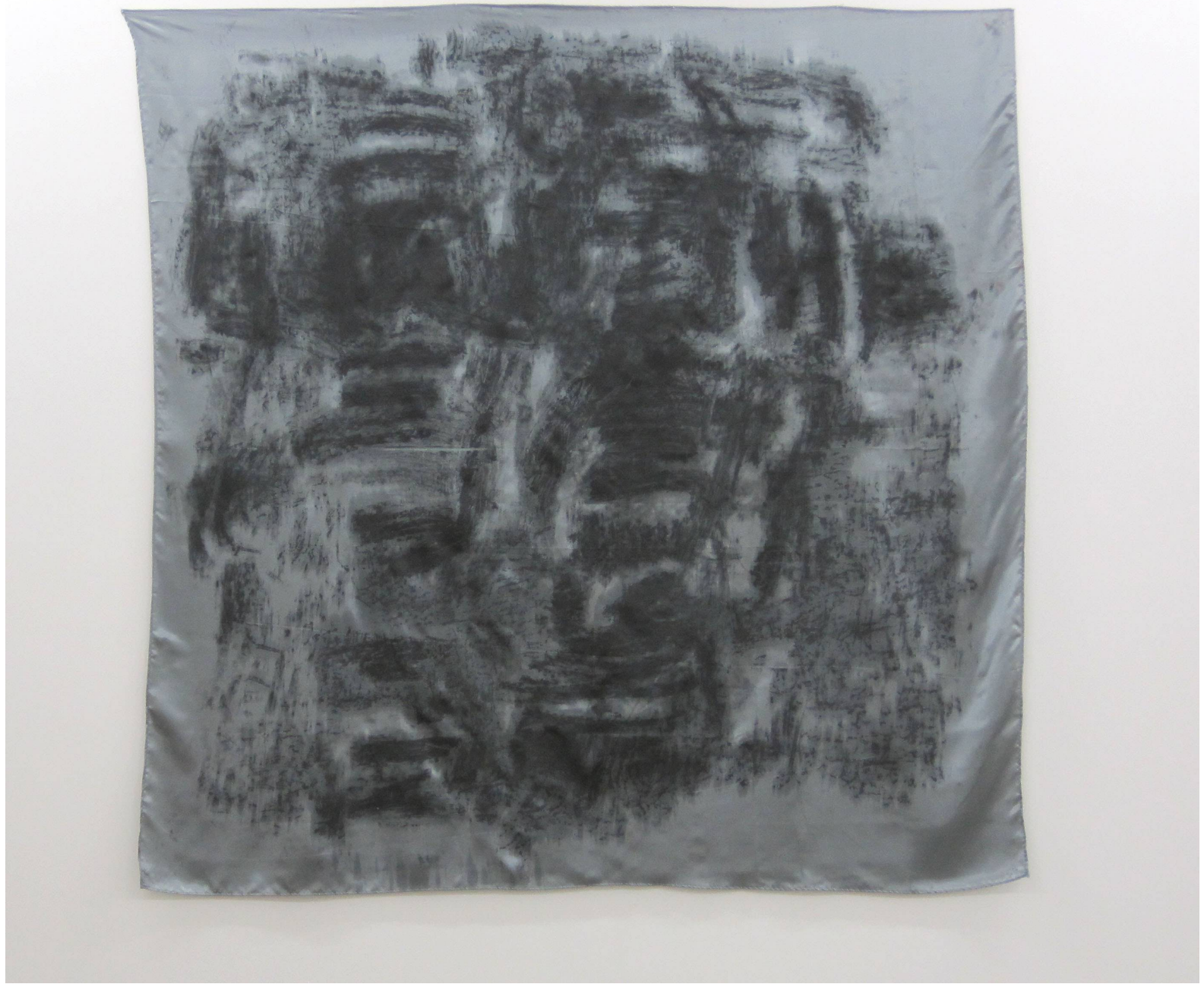
Stonehenge , 3 ways, Charcoal oil on polyester, 85 inches x 85 inches, 2015