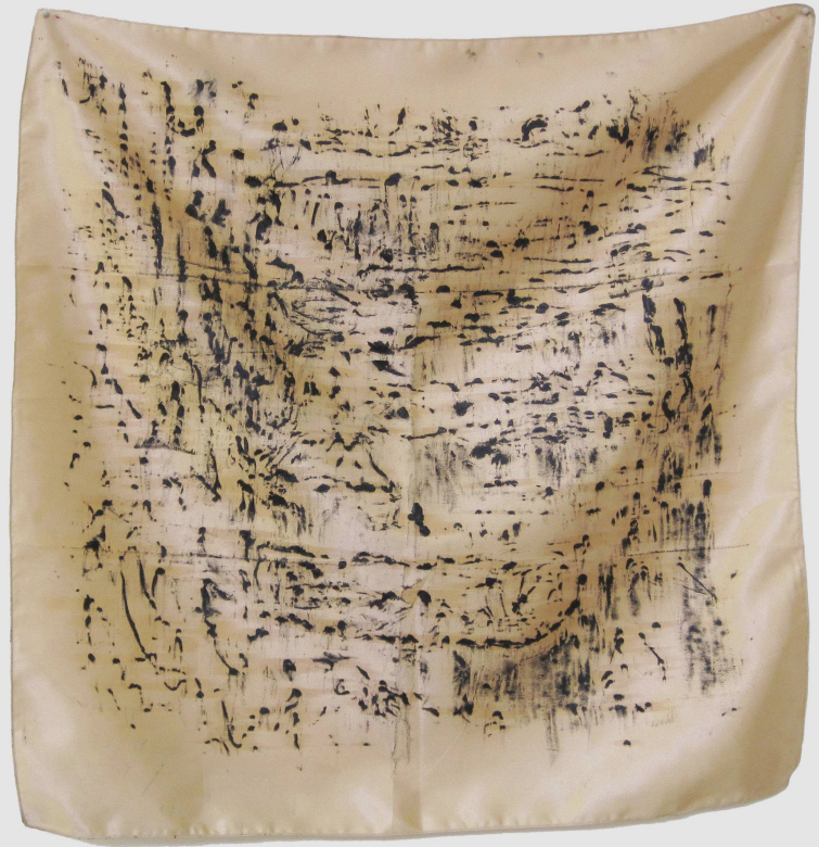
Untitled oil on polyester, 19 inches x 19 inches, 2015