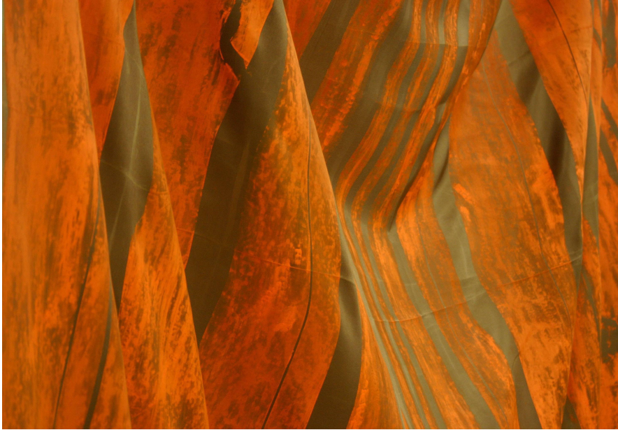
Warped (detail) oil on polyester, 72 inches x 130 inches, 2015

Ann Glazer's PACKABLE , an ultra-light, compressible show that questions the constraints of weight and space in an increasingly mobile society.