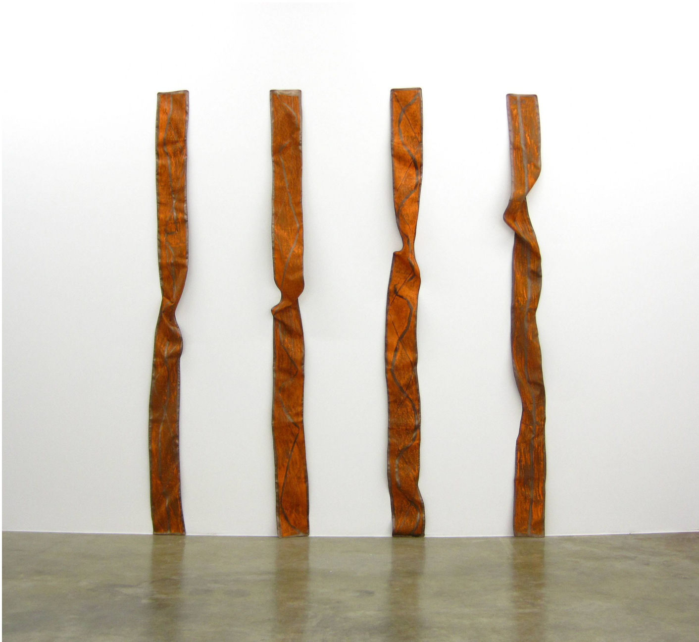
Rusted III, Vertical, A,B,C,D oil on polyester, dimensions variable, 2015