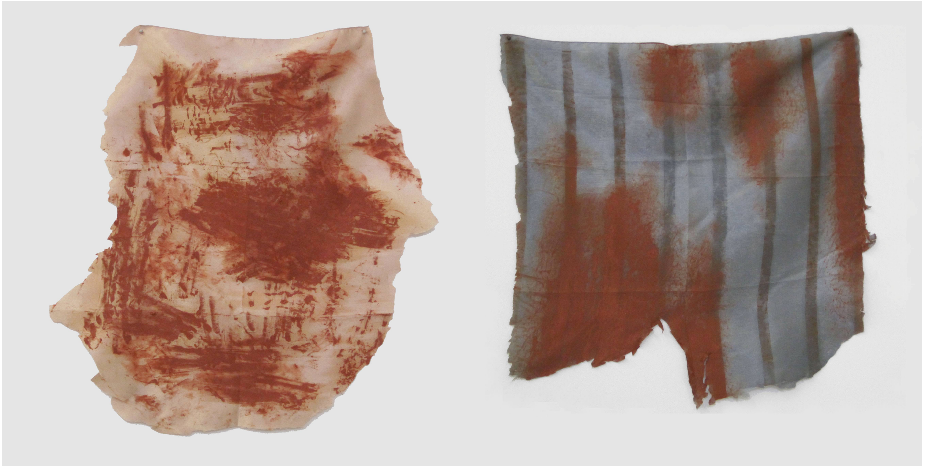
Untitled oil on polyester, 18 inches x 17 inches, 2015