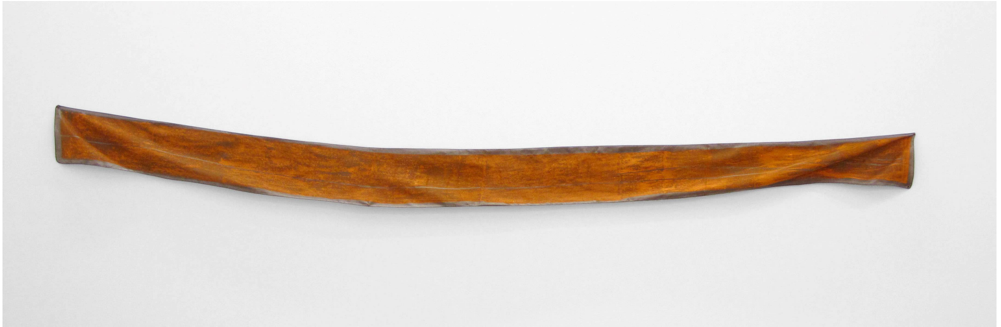
Rusted II, Horizontal oil on polyester, dimensions variable, 2015