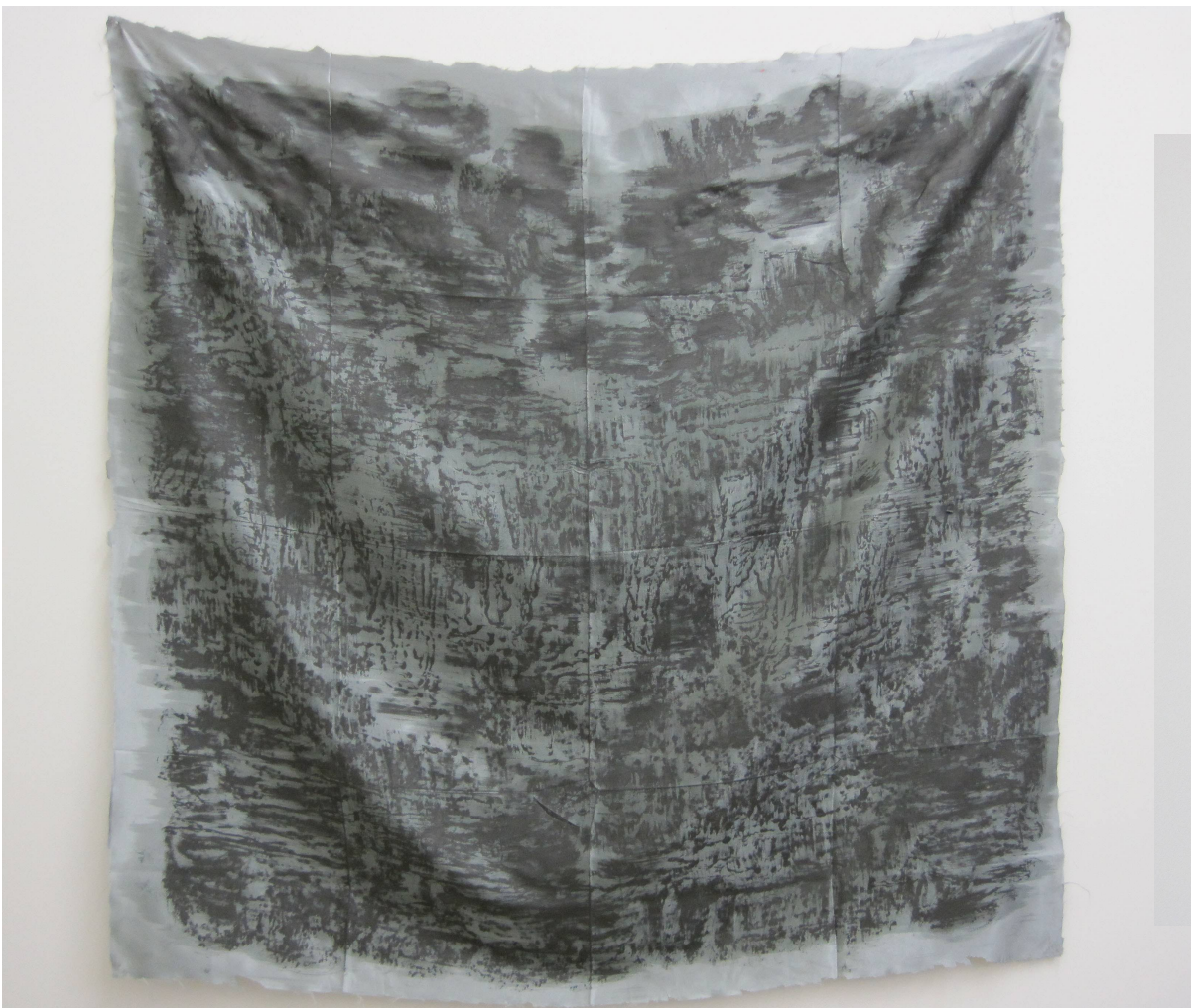
Untitled oil on polyester, 55 inches x 53 inches, 2015