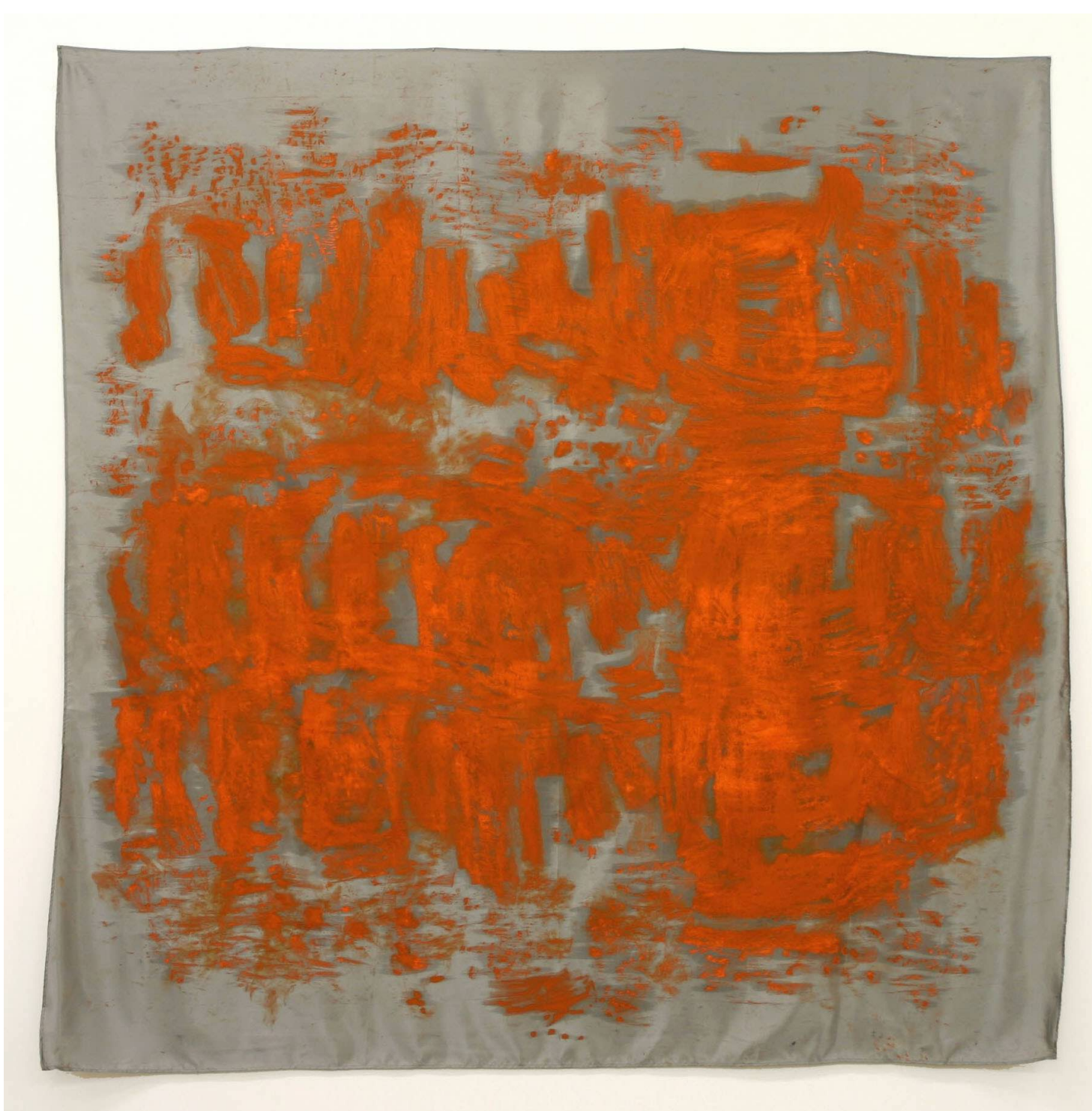
Stonehenge 4 Ways, Orange oil on polyester, 85 inches x 85 inches, 2015