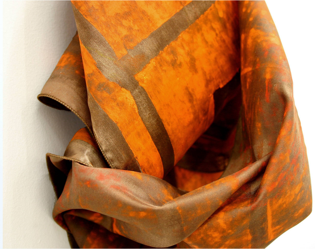
Rusted I, Twisted (detail) oil on polyester, dimensions variable, 2015