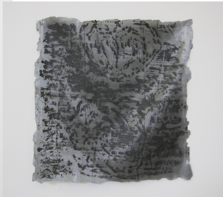
Untitled oil on polyester, 19 inches x 19 inches, 2015