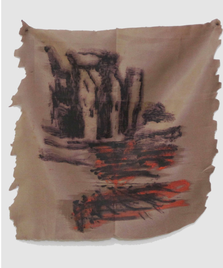
Untitled oil on polyester, 17 inches x 19 inches, 2015