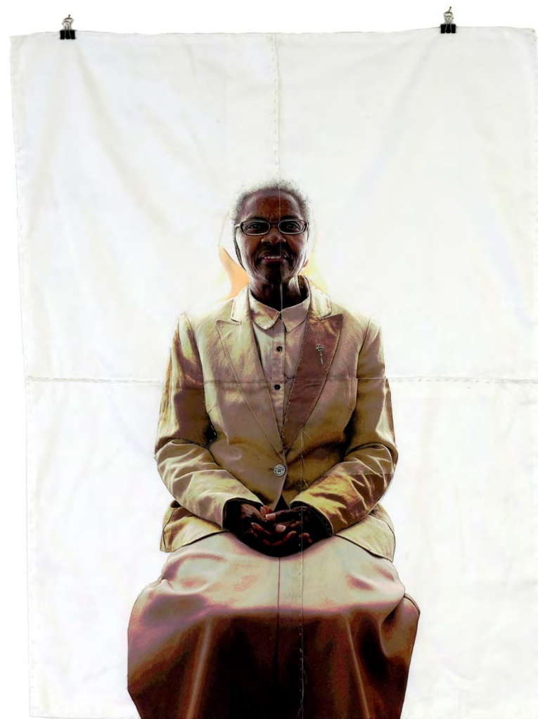
Sister Sarah pigment print of fabric, 27" x 36", 2014