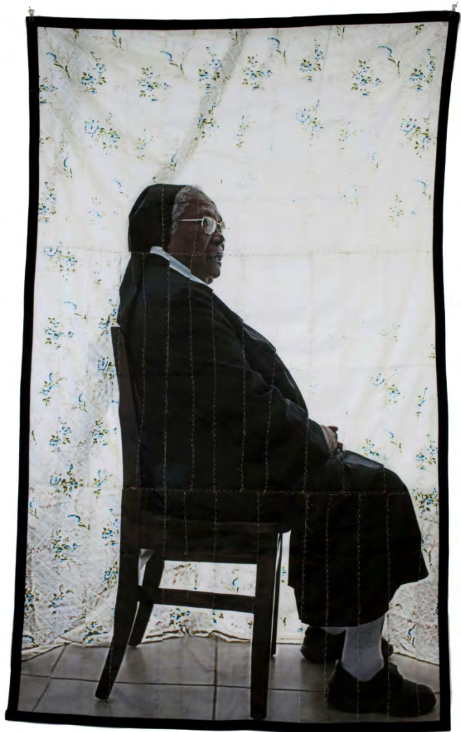
Sister Rebecca pigment print of fabric, 48" x 72", 2014