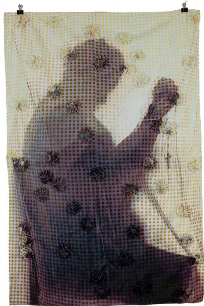
Sister Jean pigment print of fabric, 38 ½" x 32 ½", 2014