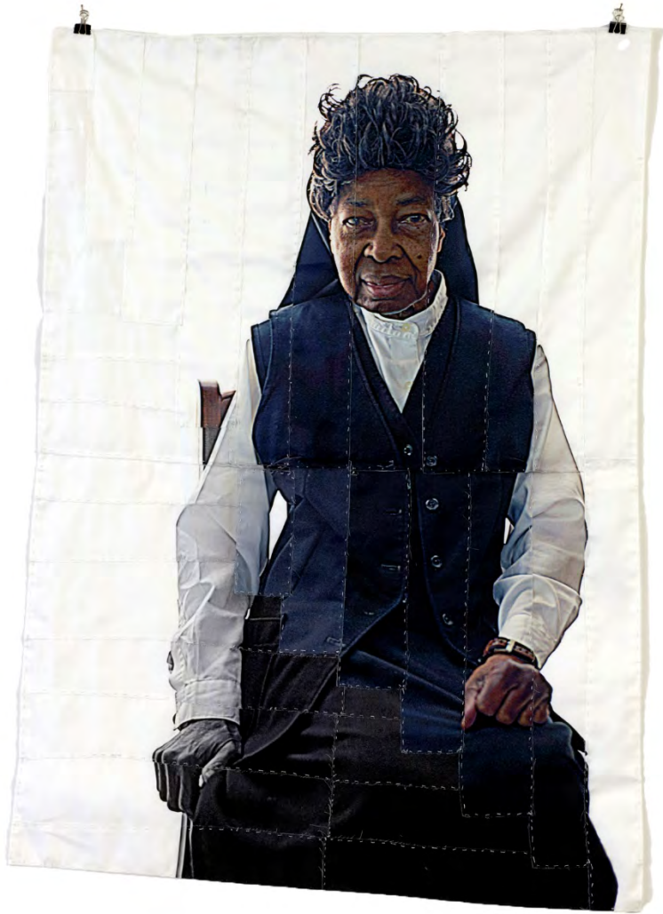
Sister Francis pigment print of fabric, 28" x 39", 2014