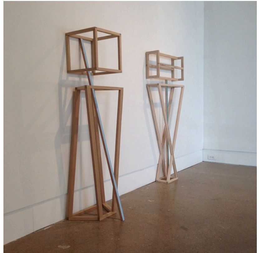
Lean 1 and Stack 1 wood and paint, 56" x 17 1/2" x 12", 2014 wood and paint, 56" x 24" x 6", 2014