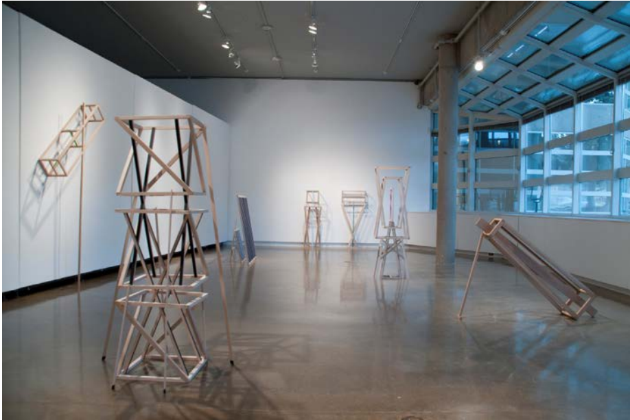
Installation View What Goes On 2014