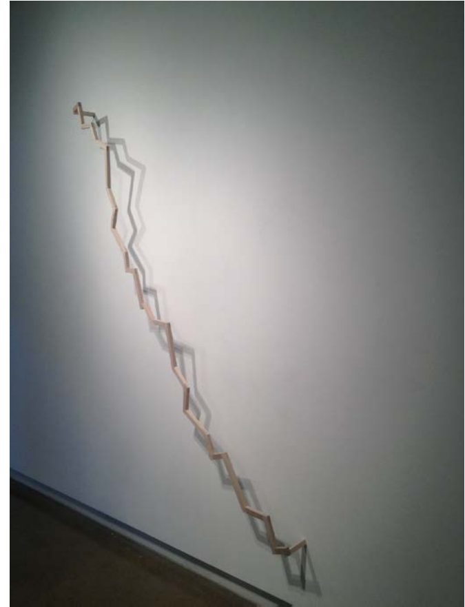
Untitled wood, 8' x 6 1/2', 2014