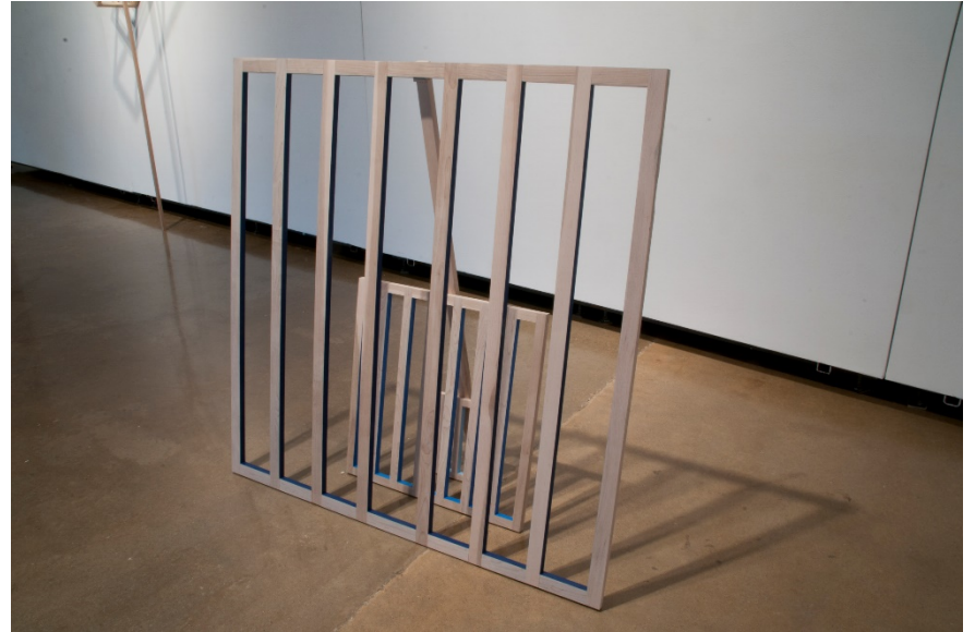
Lean 2 Wood and paint, 4' x 4' x 16", 2014