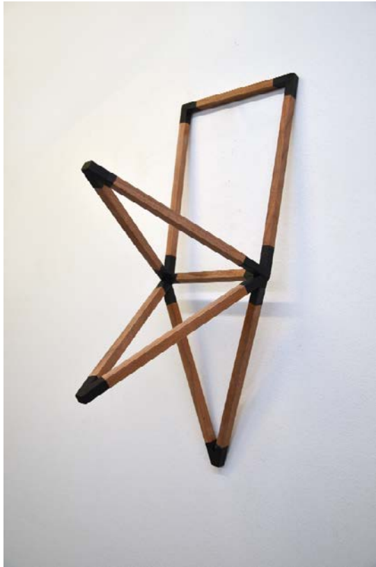
Untitled Wood and paint, 2013