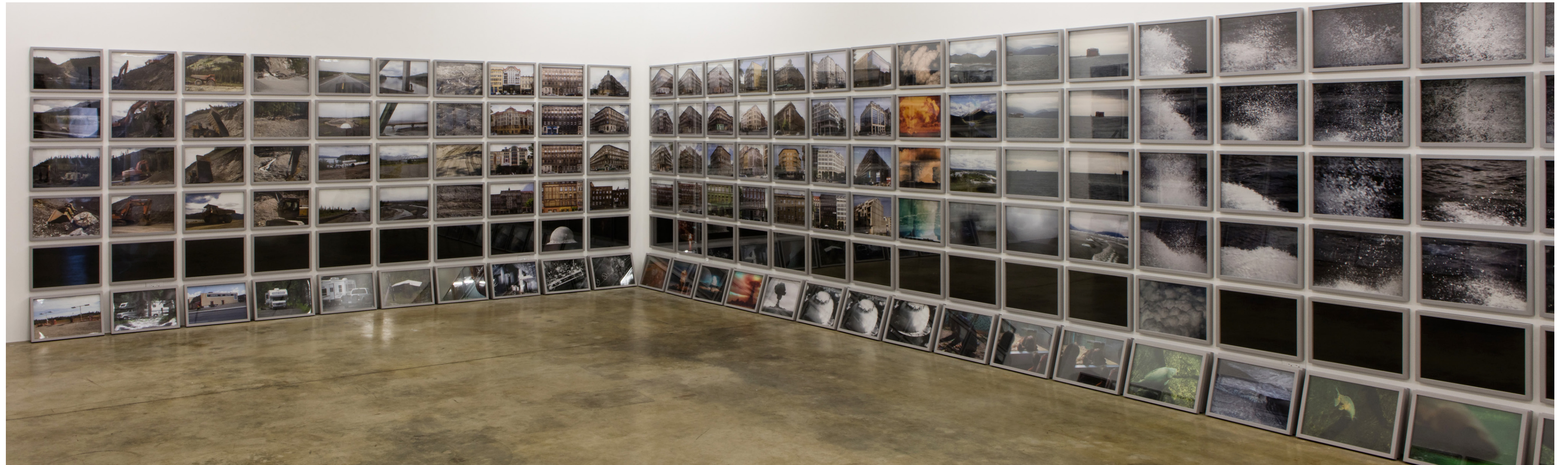
TABLE, 2016, installation view at Liliana Bloch Gallery