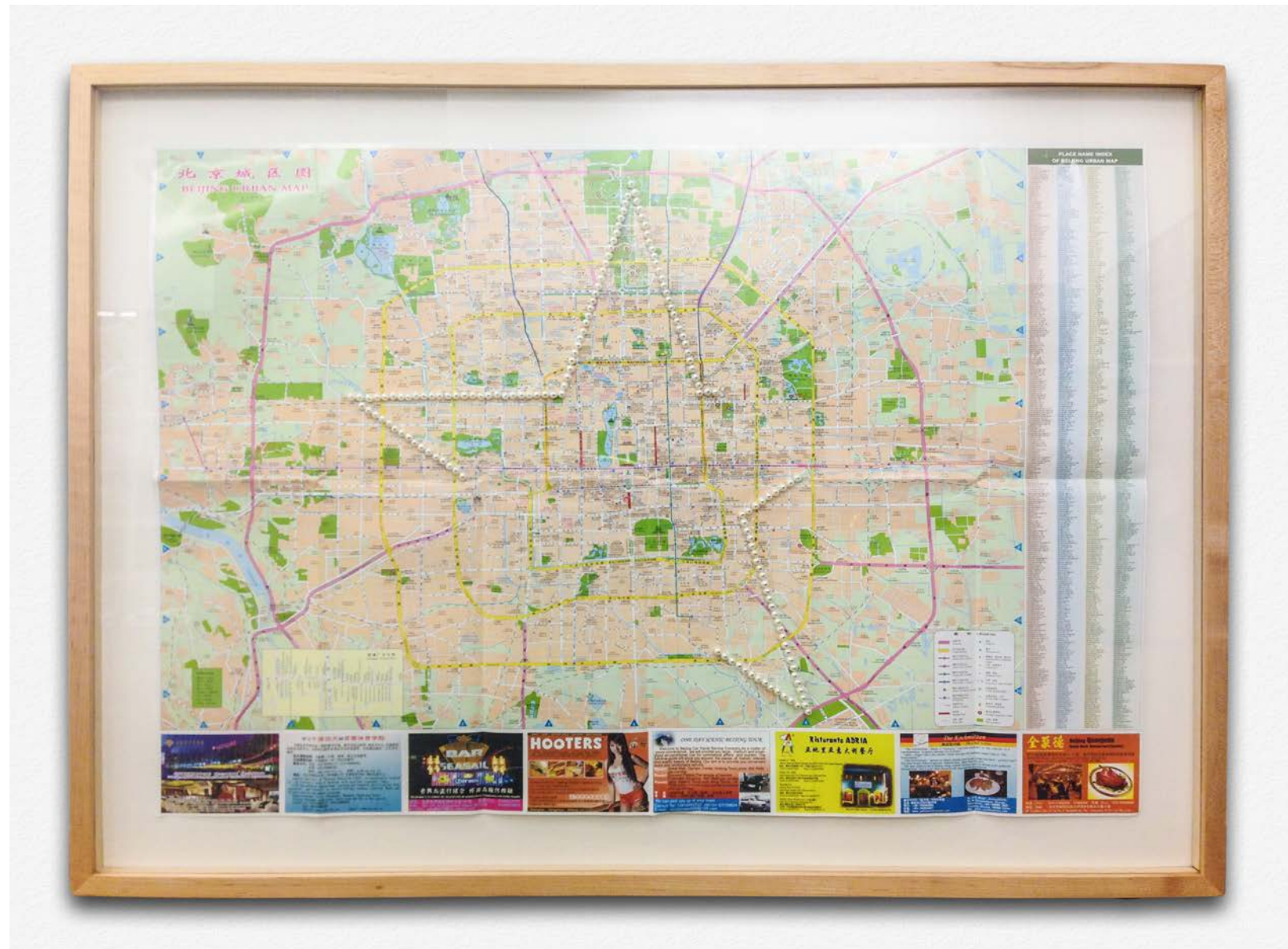
Diptych with Pearls 1 , 2008, printed material, pearls, 27 x 40 inches