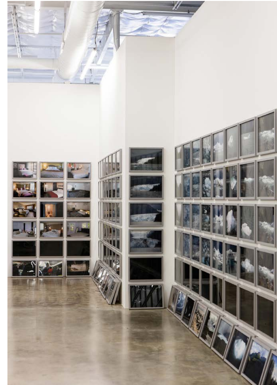
TABLE, 2016, installation view at Liliana Bloch Gallery