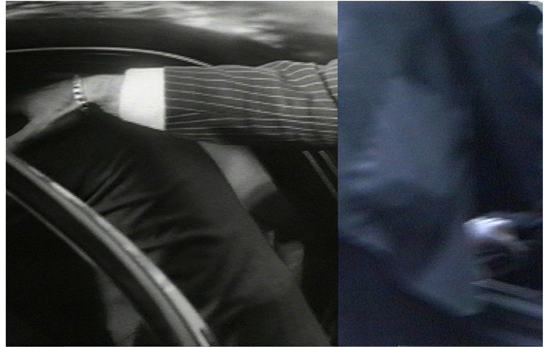
Kindly (Print 4) , 1999, gelatin silver print, 27 x 40 inches