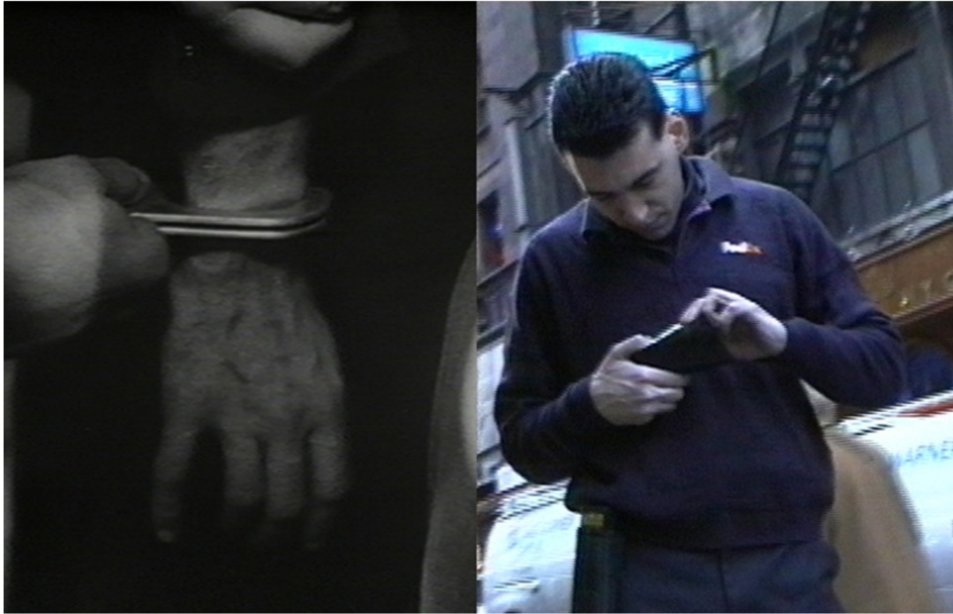
Kindly (Print 3) , 1999, gelatin silver print, 27 x 40 inches