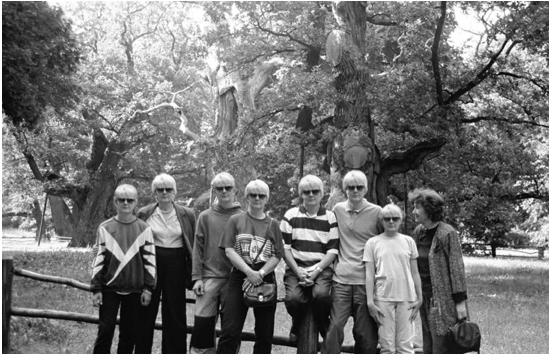
2001 ( Heritage ), 1997-1999, gelatin silver print, 27 x 40 inches