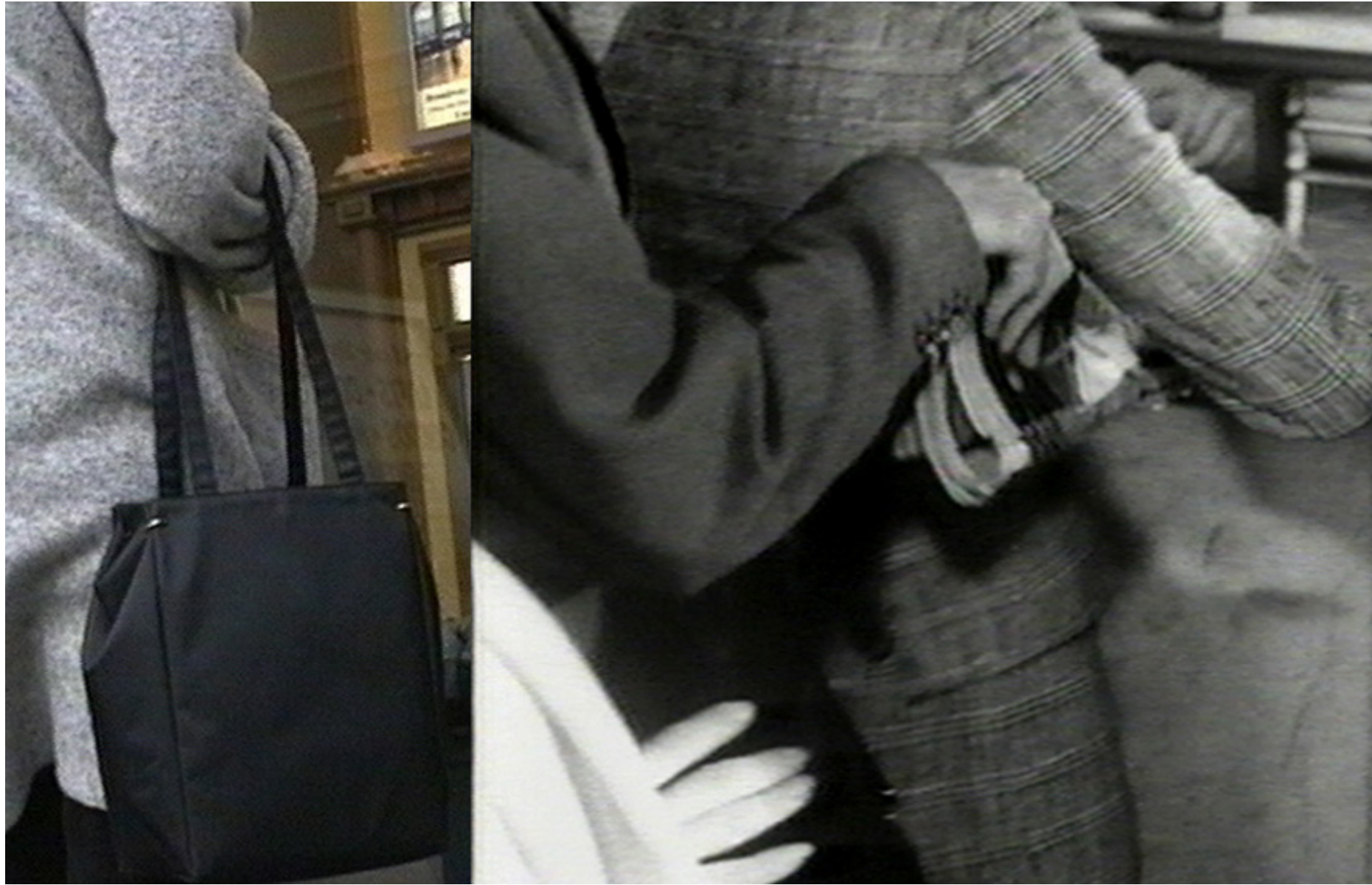
Kindly (Print 1) , 1999, gelatin silver print, 27 x 40 inches