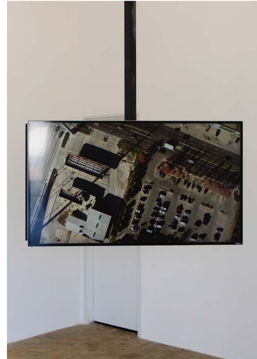
32° 47' 56.6678" N 96° 50' 9.5598" W, 2016, installation view at Liliana Bloch Gallery