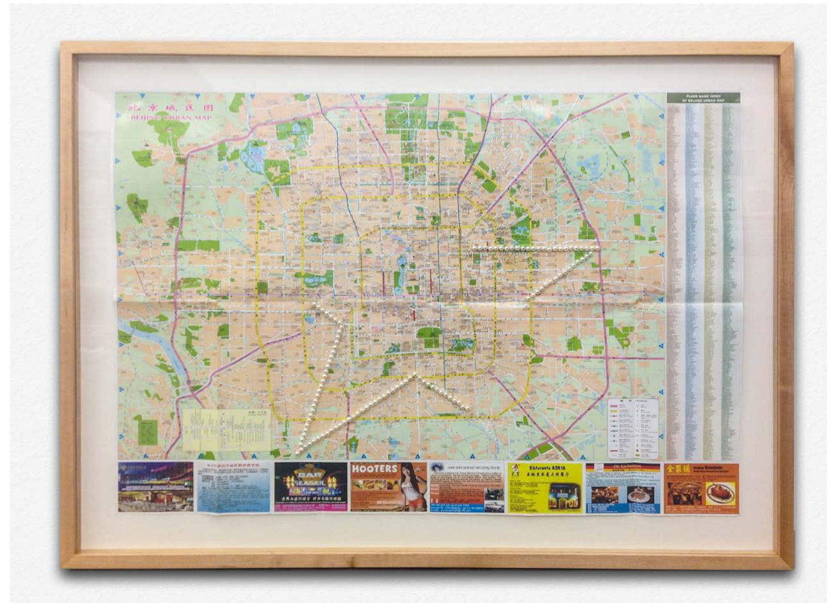
Diptych with Pearls 2 , 2008, printed material, pearls, 27 x 40 inches