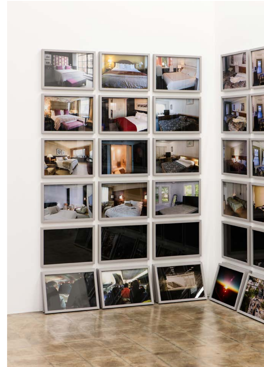
TABLE, 2016, installation view at Liliana Bloch Gallery