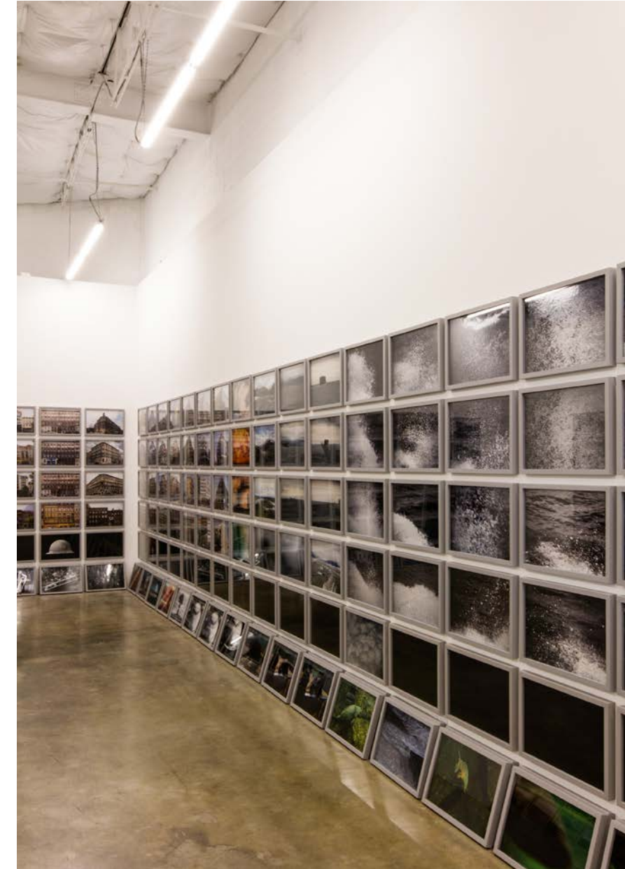
TABLE , 2016, installation view at Liliana Bloch Gallery